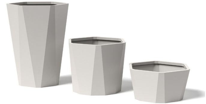
1250-1252 | Facet in Satin White