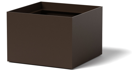
1029 | Medium Box in Standard Powder Coat Hammered Bronze