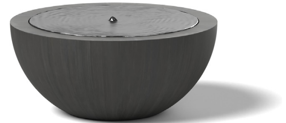
5003 | Water Bowl in Oxidized Zinc Patina