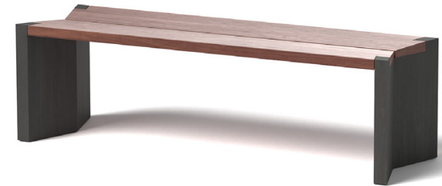
3006 | Chevron Bench in Oxidized Zinc Patina