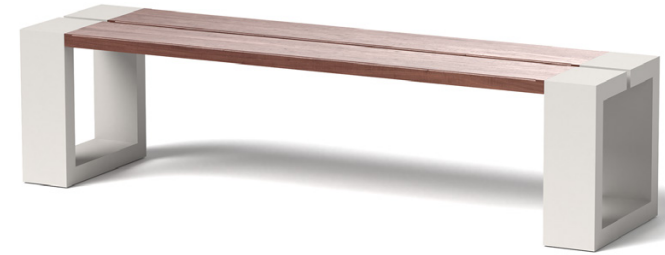
3005 | Channel Bench in Standard Powder Coat White