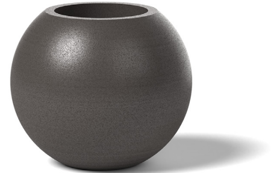
1212 | Medium Orb in Standard Powder Coat Hammered Silver