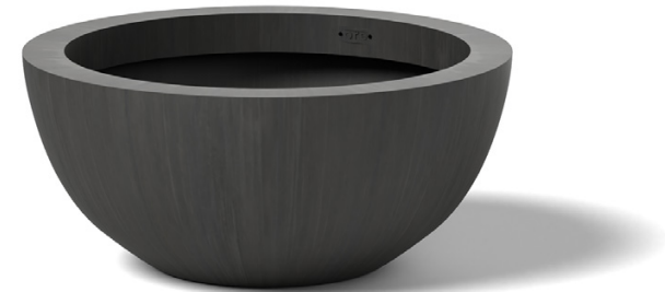
1207 | Large Bowl in Oxidized Zinc Patina