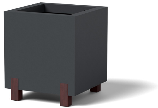
1017 | Small Stilt in Standard Powder Coat Red

LEED® POINTS: 1) Material Content 2) Indoor Environmental Quality - Manufacturing 3) Indoor Environmental Quality - Low VOCs 4) Material Reuse 5) Proximity