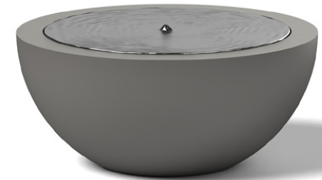
5003 | Water Bowl in Oxidized Zinc Patina