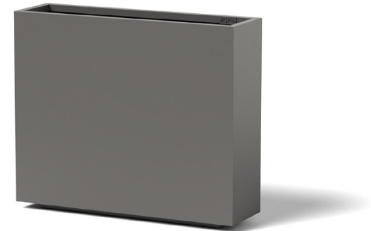
1115 | Large Slab in Standard Powder Coat Metallic Silver