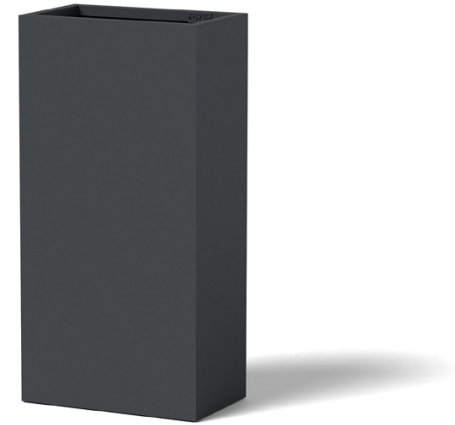
1113 | Large Bar in Standard Powder Coat Charcoal Gray