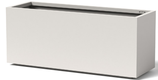
1110 | High Rectangle in Standard Powder Coat Linen White