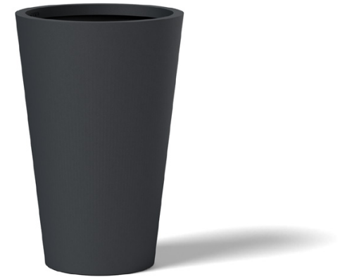
1214 | Round Taper in Standard Powder Coat Charcoal Gray