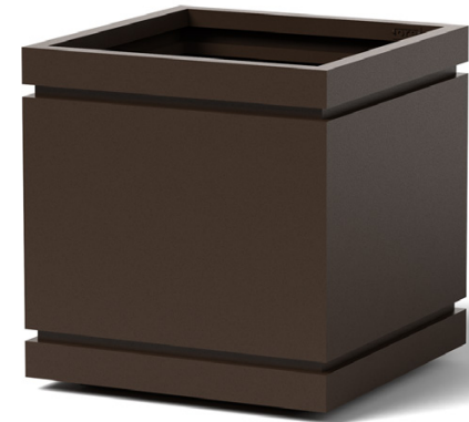
1024 | Double Groove in Standard Hammered Bronze Powder Coat