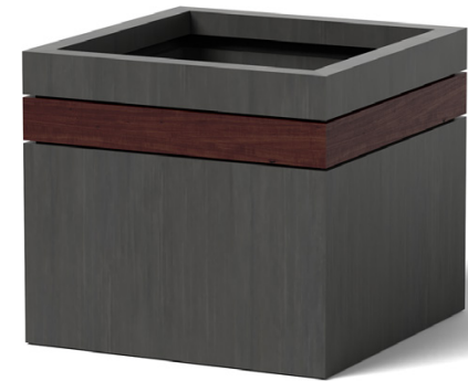
1021 | Small Band in Oxidized Zinc Patina with Naturally-Treated Ipe Wood