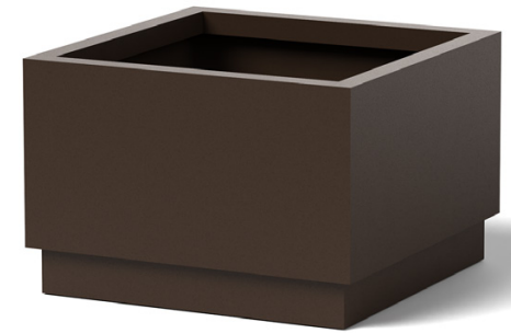
1020 | Large Base in Hammered Bronze