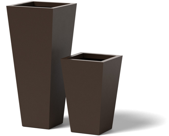
1003, 1004 | Taper in Standard Powder Coat Hammered Bronze