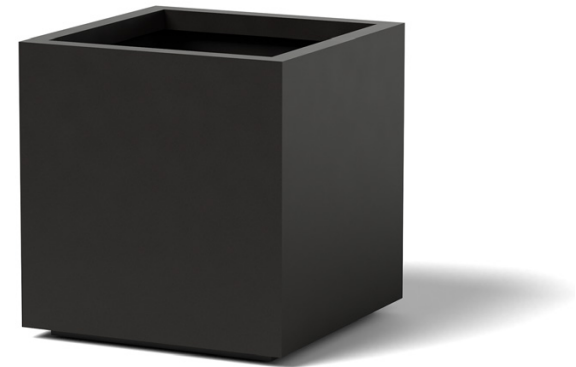
1002 | Medium Cube in Standard Powder Coat Black